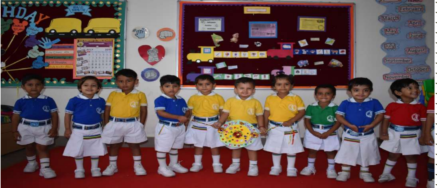
Rakshabandhan – a bond of Love